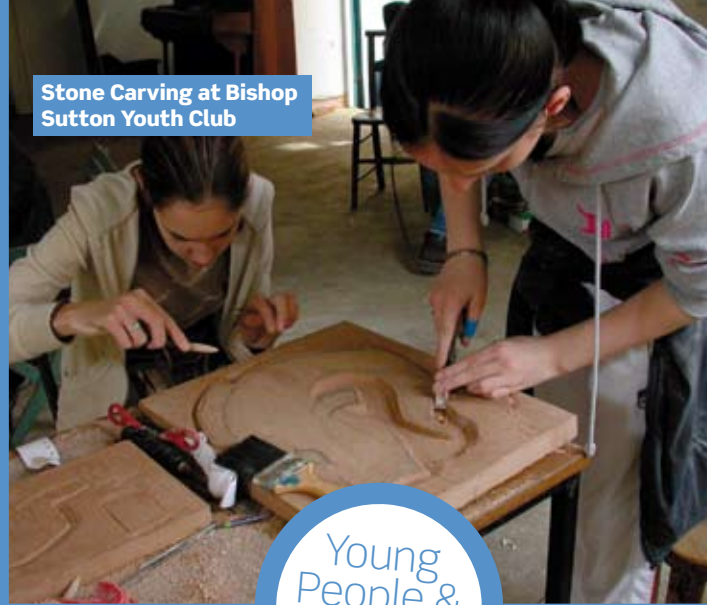
Stone Carving at Bishop Sutton Youth Club