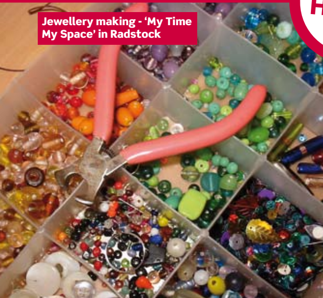
Jewellery making - 'My Time My Space' in Radstock

We have filmed participants in our successful 'My Time, My Space' courses during the autumn and we have also been filming our new project, 'Fit for Life' running since January 07 with children aged 8-11 at St Nicholas School in Radstock, encouraging healthy body image, healthy lifestyles and increased physical activity. Stemming from a survey which revealed that Norton Radstock had the highest incidences of childhood obesity within Bath & North East Somerset, we worked with several partners including the Health Visitor Team to devise this project. The DVDs will be made available in the summer.