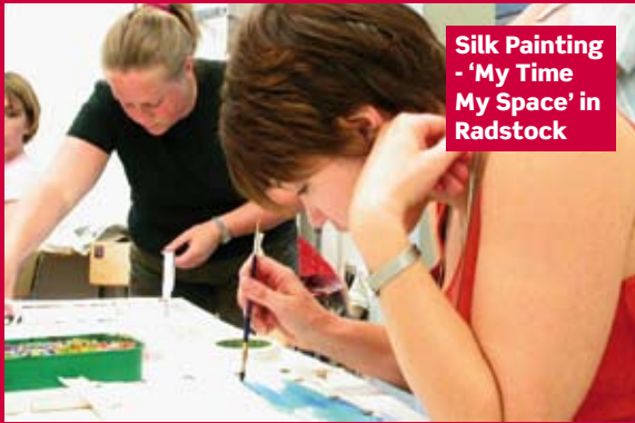
Silk Painting - 'My Time My Space' in Radstock

We have filmed participants in our successful 'My Time, My Space' courses during the autumn and we have also been filming our new project, 'Fit for Life' running since January 07 with children aged 8-11 at St Nicholas School in Radstock, encouraging healthy body image, healthy lifestyles and increased physical activity. Stemming from a survey which revealed that Norton Radstock had the highest incidences of childhood obesity within Bath & North East Somerset, we worked with several partners including the Health Visitor Team to devise this project. The DVDs will be made available in the summer.