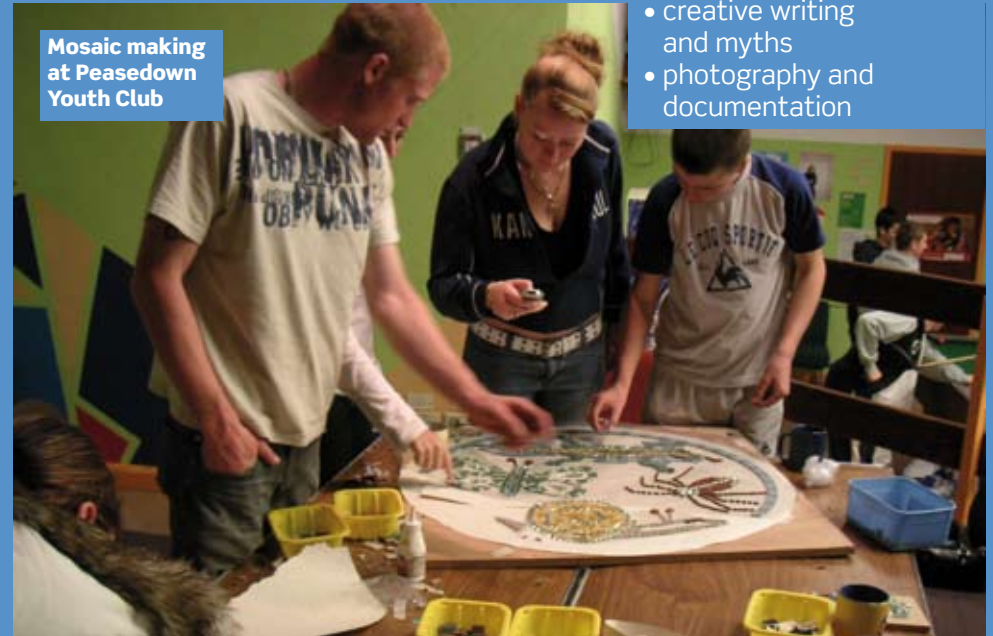
Mosaic making at Peasedown Youth Club